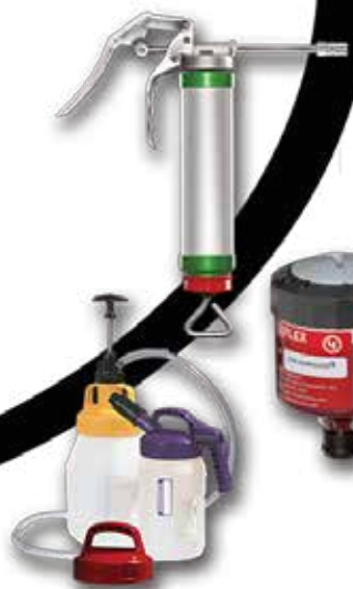
Handling & Transfer