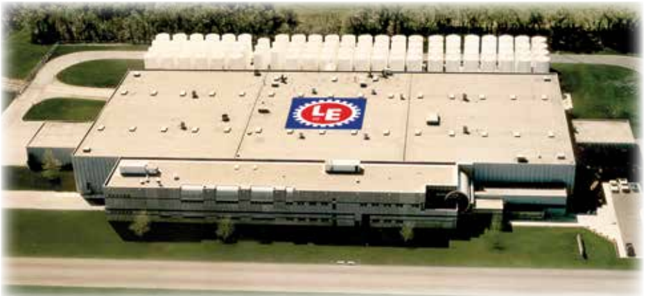
LE's manufacturing and technology centre in Wichita, Kan.