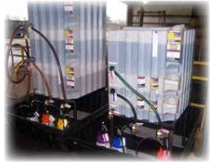
Poly Tank Storage Solutions