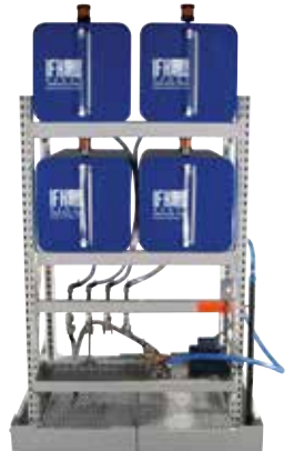
Metal Tank Storage Solutions